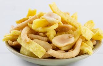
Trio Spice Snack Mix