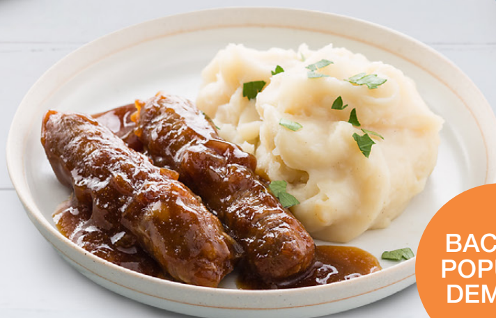
Bangers & Mash